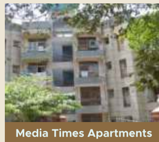
Media Times Apartments