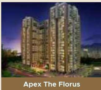
Apex The Florus