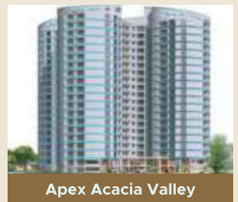
Apex Acacia Valley