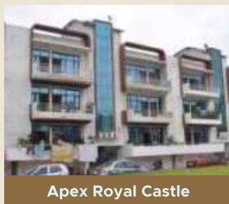
Apex Royal Castle